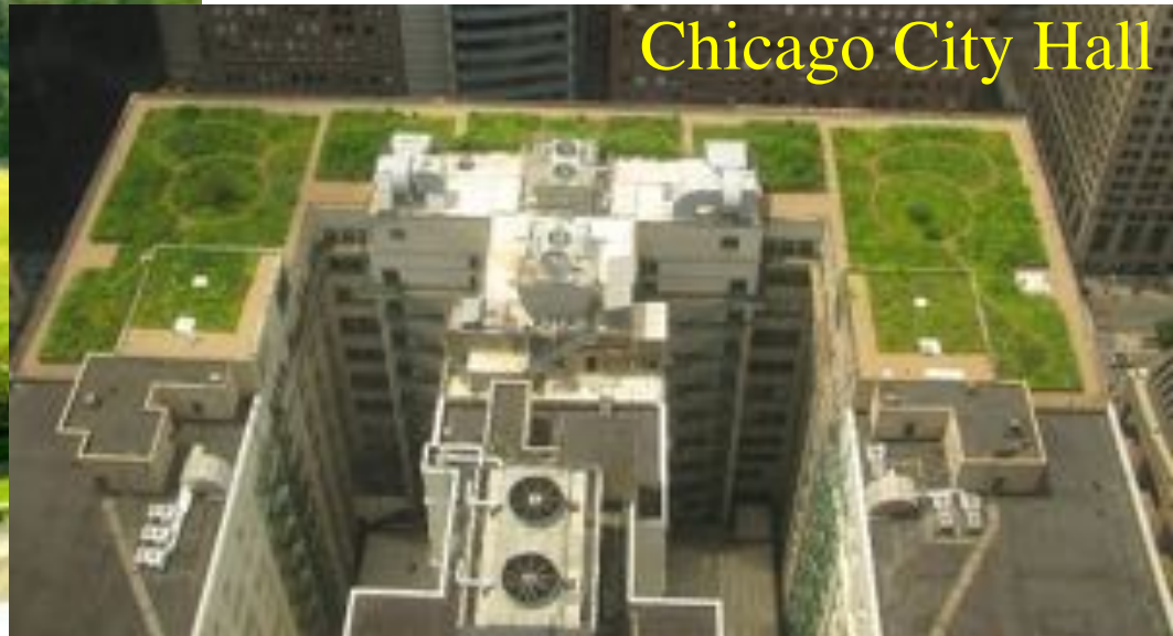
Chicago City Hall